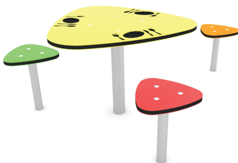
TABLE WITH SEATS